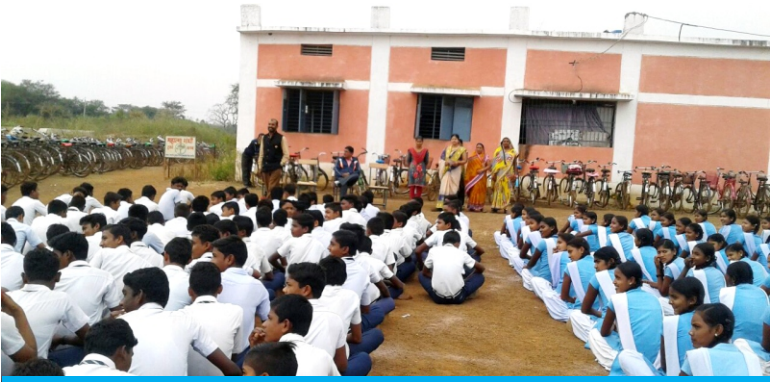
Discussion with School Children