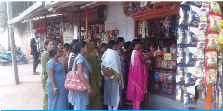
Dialogue with Shopkeeper

Chhattisgarh has a community-health-worker (CHW) program since 2002 with 70,000 CHWs called Mitans. They also lead community health committees in villages and in urban-slums. The community action strategy was designed based on the understanding - a) Awareness needs to be increased on harmful effects of smokeless tobacco and the innocence around use of oral-application products needs to be broken b) While there is enough communication about cancer, linkage between stroke and tobacco needs to be communicated. Registers maintained by CHWs with community reported causes of mortality could be used to make it more visible c) Focus on school children and putting collective pressure to reduce sale of tobacco near schools and demand accountability from government authorities d) Focus on women as CHWs interact frequently with them. A start could be made with CHWs quitting tobacco-use themselves.