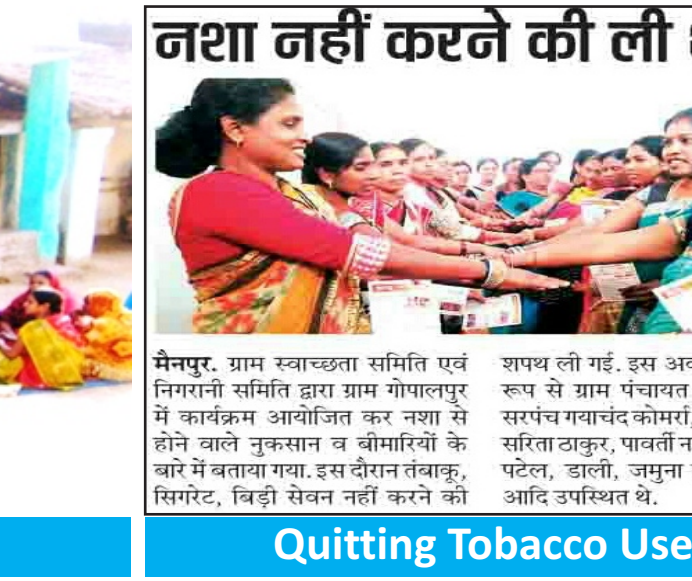
Quitting Tobacco Use