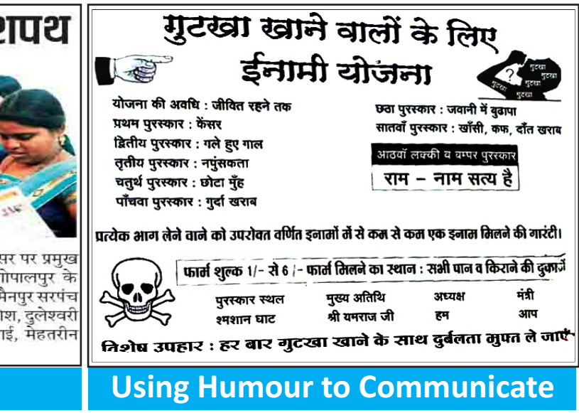
Using Humour to Communicate